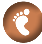
Blood spot screening

Newborn hearing screening is a test that checks babies for hearing loss in the range where speech is heard. It is one of three newborn screens that should take place soon after birth, along with blood spot and pulse oximetry screening.