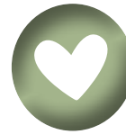
Pulse oximetry screening