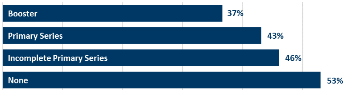
Percent of respondents who reported at least one long-lasting symptom