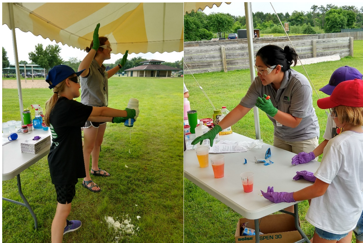
MDH staff teach chemical safety basics through interactive demonstrations.

City-organized Safety Camps are eager for experts to teach chemical safety and the TFK program has led sessions on this topic for the past seven years at Cottage Grove's Safety Camp. Children learn how to identify safe and unsafe chemical products. In 2019, MDH added a new chemical safety topic: identifying sustainable products for the home. Children participated in making do-it-yourself, low-cost, and toxic-chemical free cleaning products they were able to bring home.